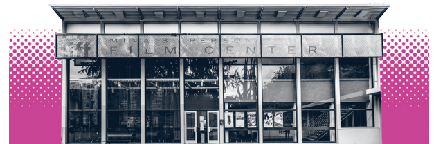
siff film center