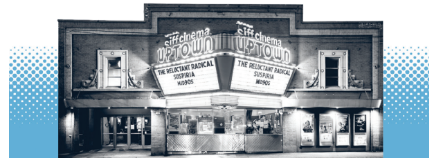
siff cinema uptown

SIFF offers year-round screenings of arthouse and mainstream films, the latest international works, one-of-a-kind special events, and festivals. Annual events include the Seattle International Film Festival, Cinema Italian Style, DocFest, Noir City, and the National Film Festival for Talented Youth.