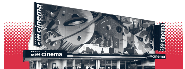
siff cinema downtown